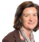
Eluned Morgan AM Welsh Labour Mid and West Wales