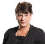
Rhianon Passmore MS Welsh Labour