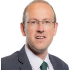
Llyr Gruffydd MS Plaid Cymru