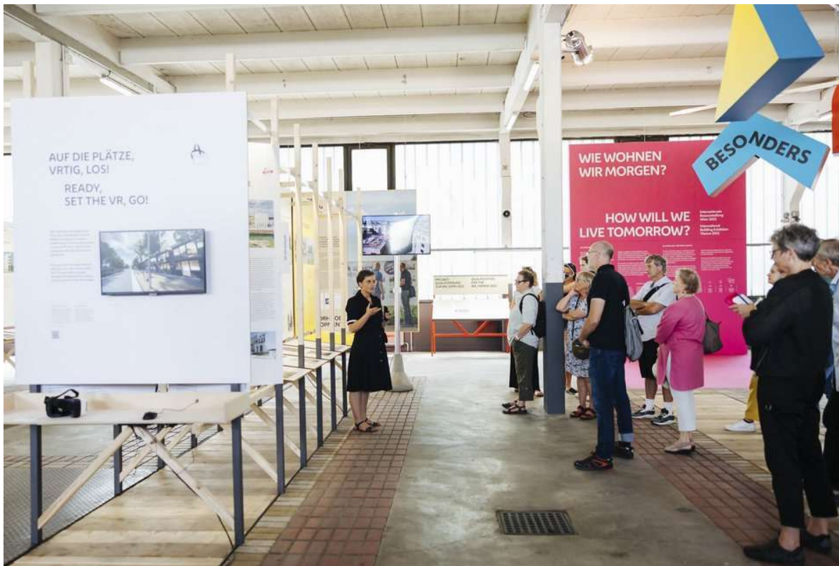
Figure 3: The 'Wie Wohnen Wir Morgen?' or 'How Will We Live Tomorrow?' exhibit.

The second leg of our visit consisted of a guided tour of the 'Wie Wohnen Wir Morgen?' or 'How Will We Live Tomorrow?' exhibit, part of an the International Building Exhibition Vienna 2022 on contemporary social housing in Vienna, as well as the future thereof. The exhibition was run by IBA Vienna for The City of Vienna (City Authority). The aim of the exhibition was to stimulate, enable and support the implementation of new developments for the future of social housing, and their realisation. The exhibition was wide-ranging, covering themes such as: