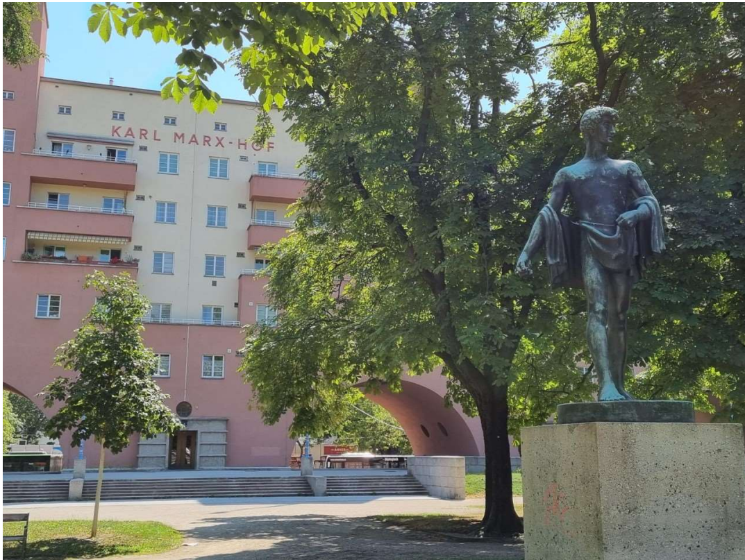
Figure 1: Karl-Marx-Hof's inner courtyard